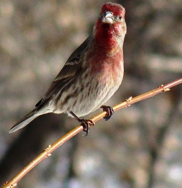
A House Finch on the Forsythia

“But now ask the beasts, and they will teach you; And the birds of the air, and they will tell you...” “Who among all these does not know That the hand of the LORD has done this, In whose hand is the life of every living thing, And the breath of all mankind?” Job 12:7, 9, 10 (NKJV)