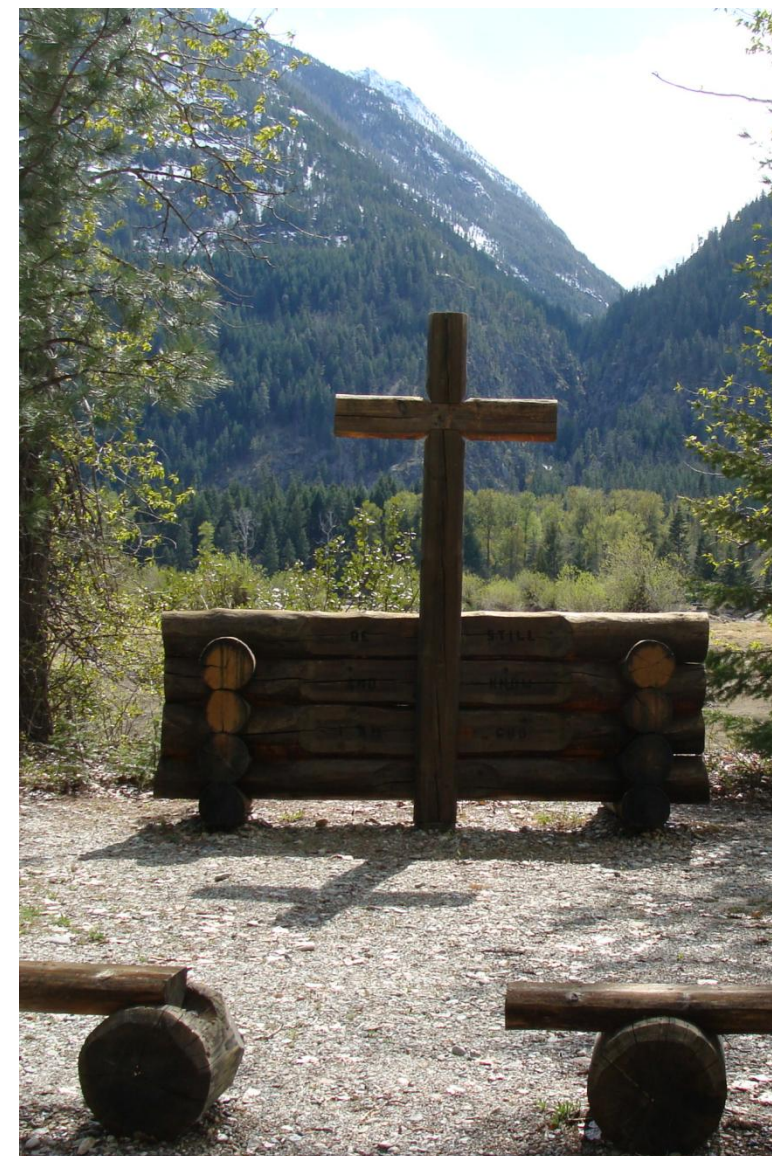
Outdoor Chapel Near Stehekin, WA